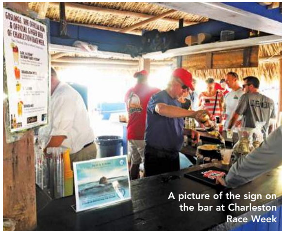
A picture of the sign on the bar at Charleston Race Week