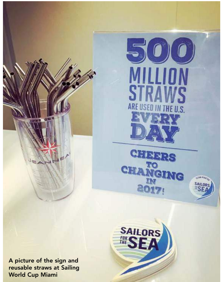
A picture of the sign and reusable straws at Sailing World Cup Miami

totaling over $430,000.00 each year and over $600,000.00 in the last 31 years.”