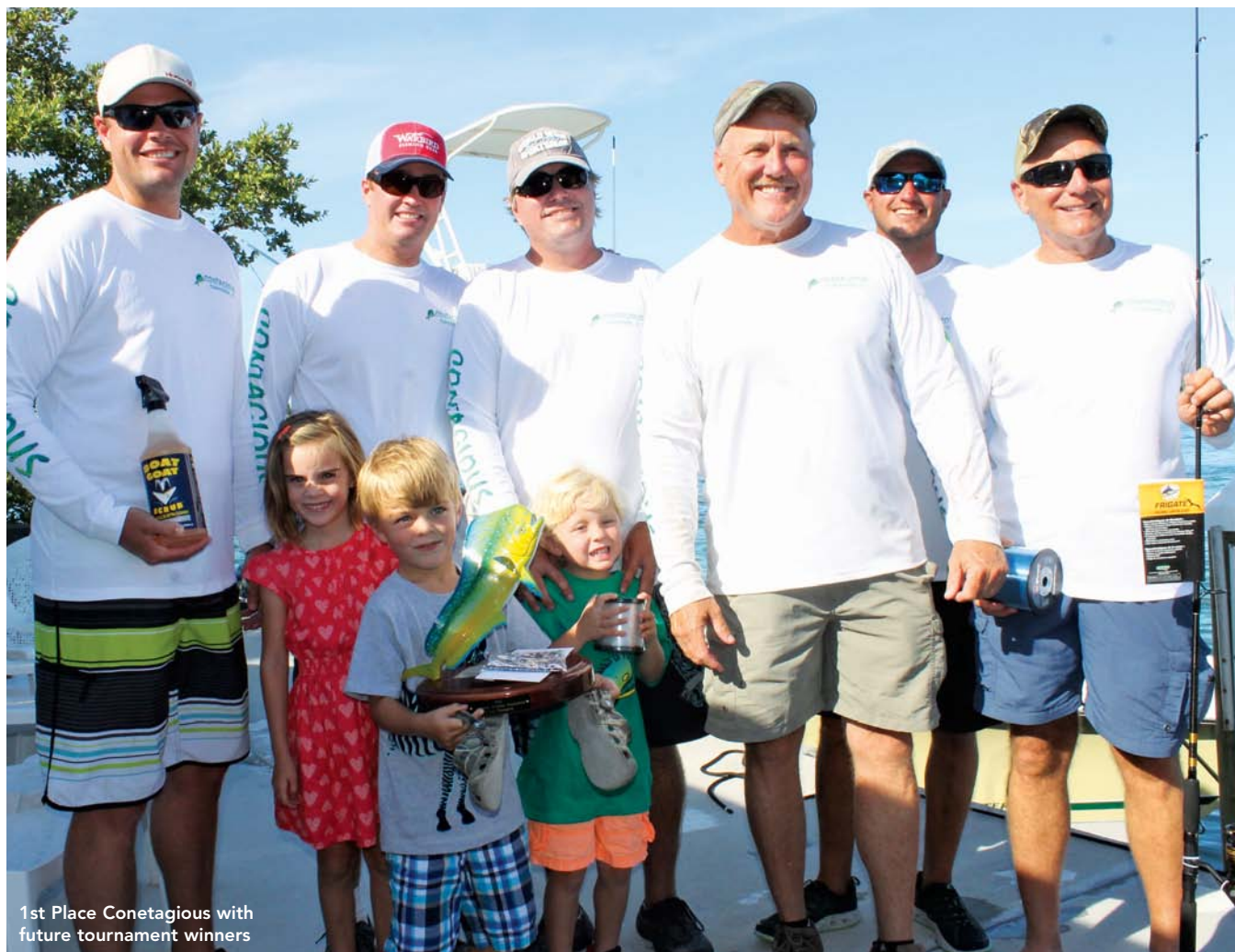
1st Place Conetagious with future tournament winners