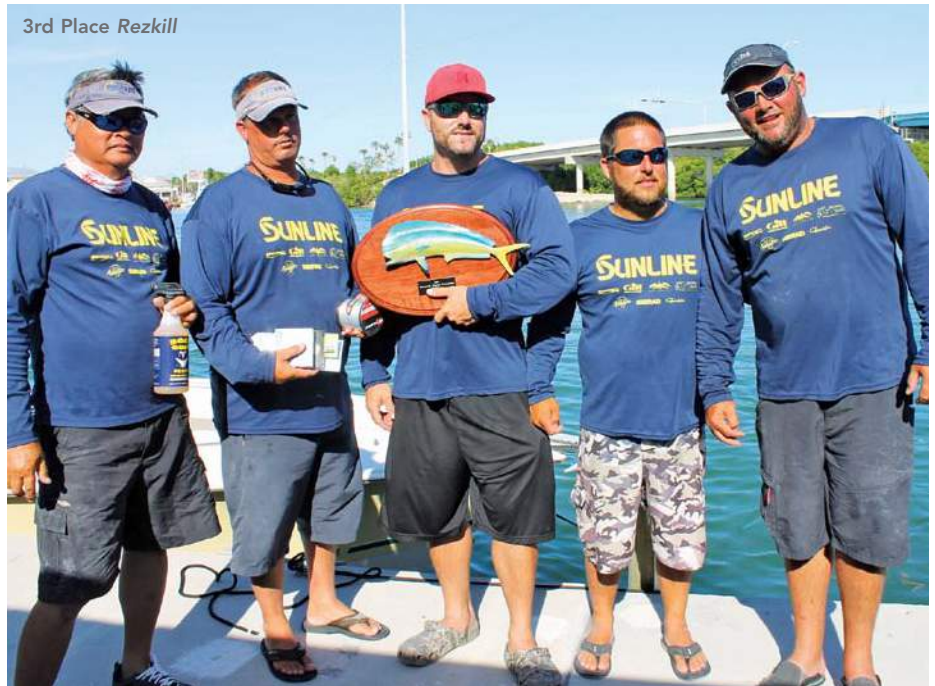
3rd Place Rezkill